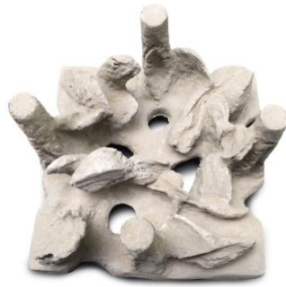
Reef Tile Unit