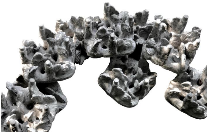
CORRT Reef Tile Interlocking System for Natural & Versatile Configurations