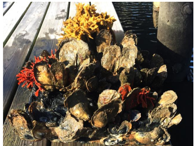
CORRT Reef Tile Results After only ONE Year